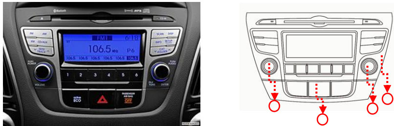
Fig11. Priority of applied texture on car console