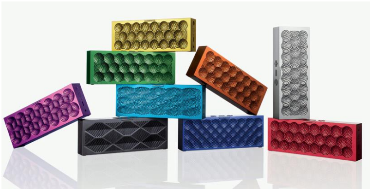
Fig4. In these speakers, texture is applied for functional reasons